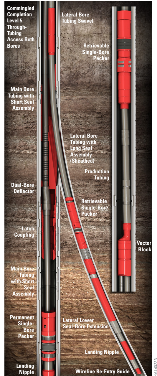
Figure 2 > FloRite® single-string commingled production/injection completions use optional vector block to maintain selective re-entry access and isolation for both the main bore and lateral bore.

For more information, contact your local Halliburton representative or visit us on the web at www.halliburton.com